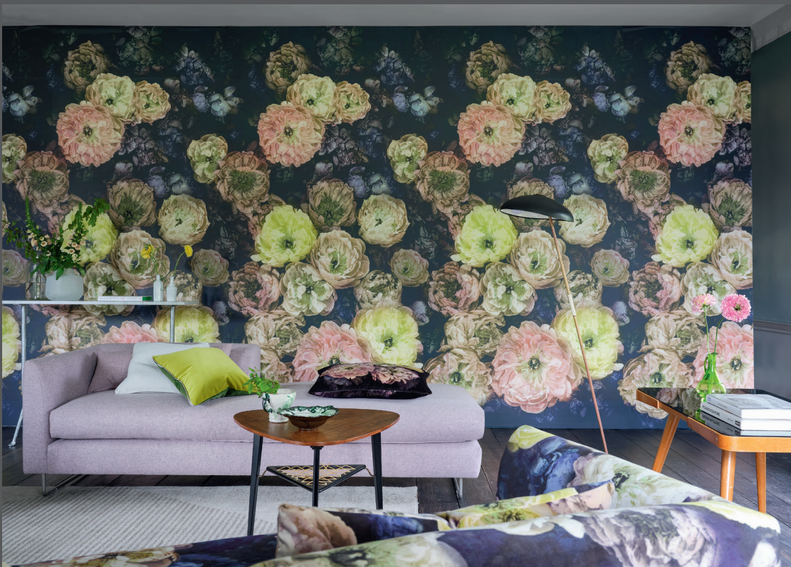
Le Poème de Fleurs Wallpaper Panel