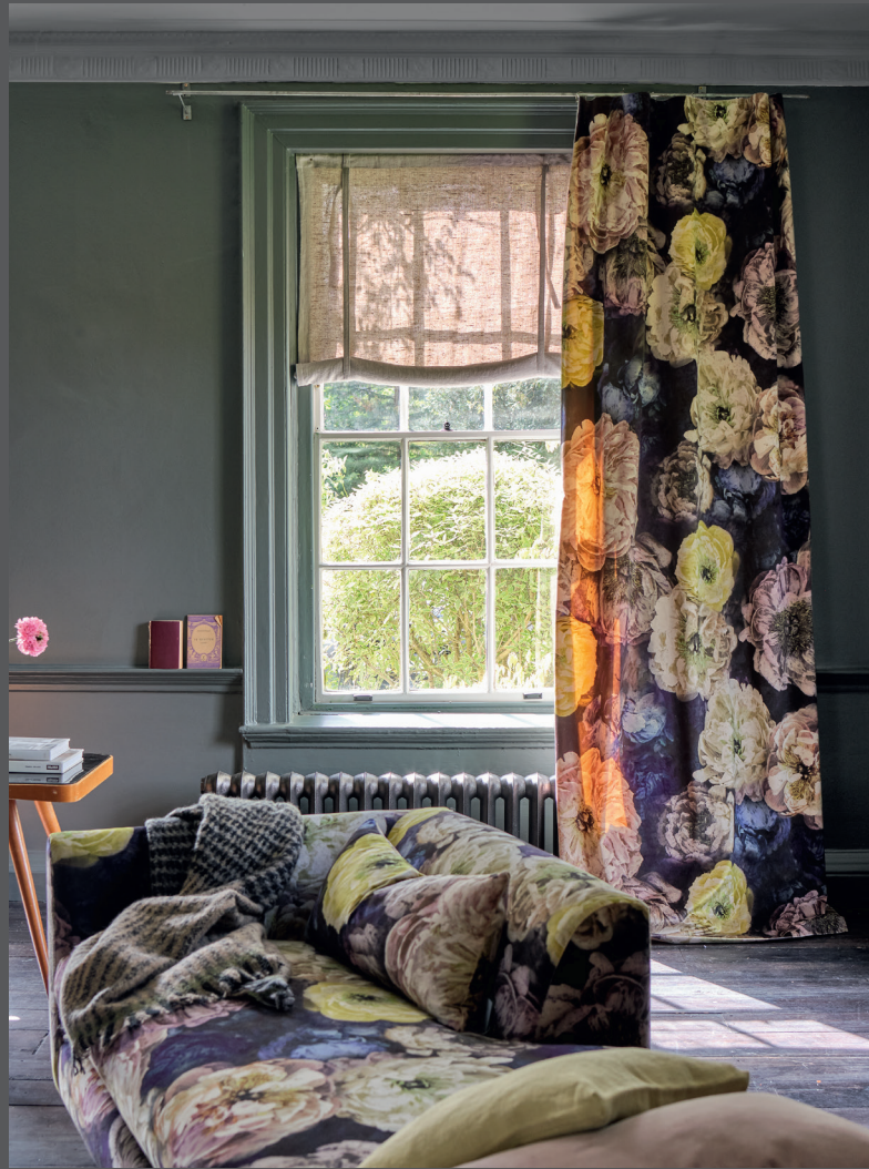
New Sleek long daybed in Le Poème de Fleurs printed velvet