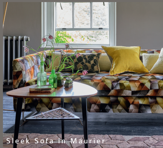
Sleek Sofa in Maurier