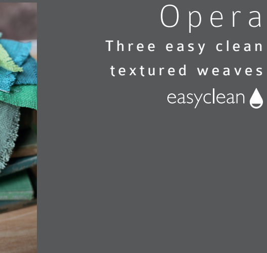
Opera Three easy clean textured weaves easyclean