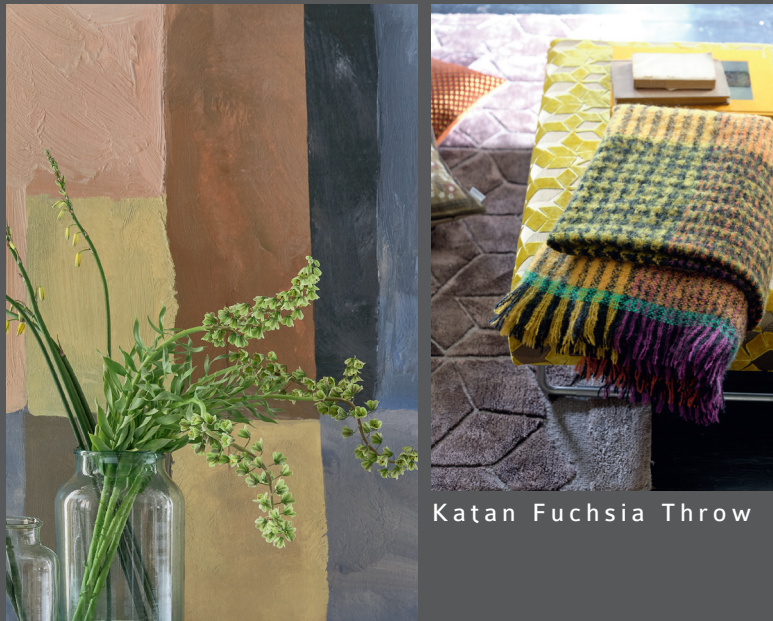
Katan Fuchsia Throw

An abstract, geometric series of rectangles. Emphasising the texture of every brush stroke.