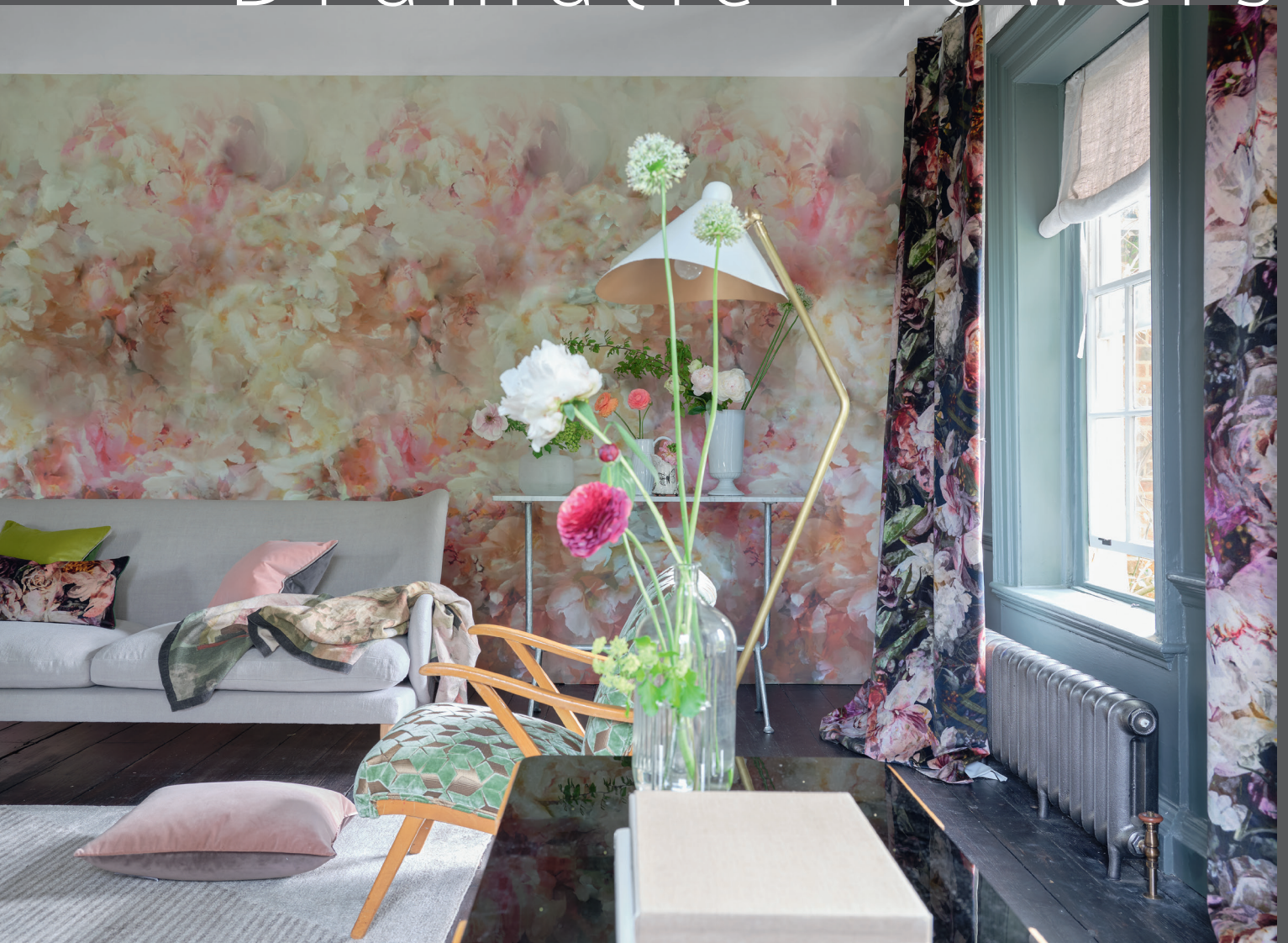
Fleur de Nuit Printed Fabric and Wallpaper Panel

Flowers for everyone and every style. From the richly theatrical and enigmatic to soft ethereal romance. Hand painted flowers digitally printed.