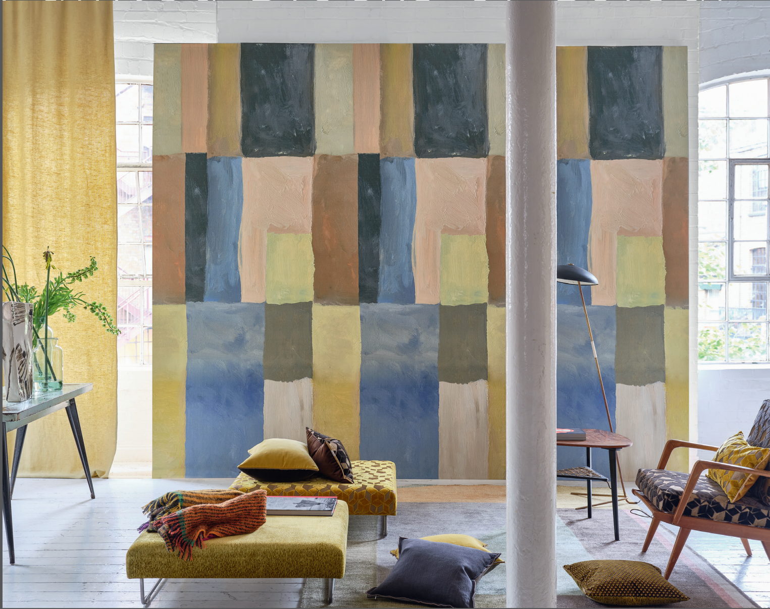
Otto Mosaic Wallpaper Panel