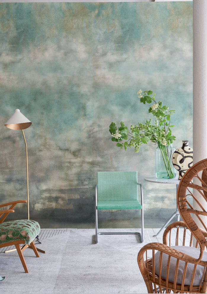
Suisai Wallpaper Panel