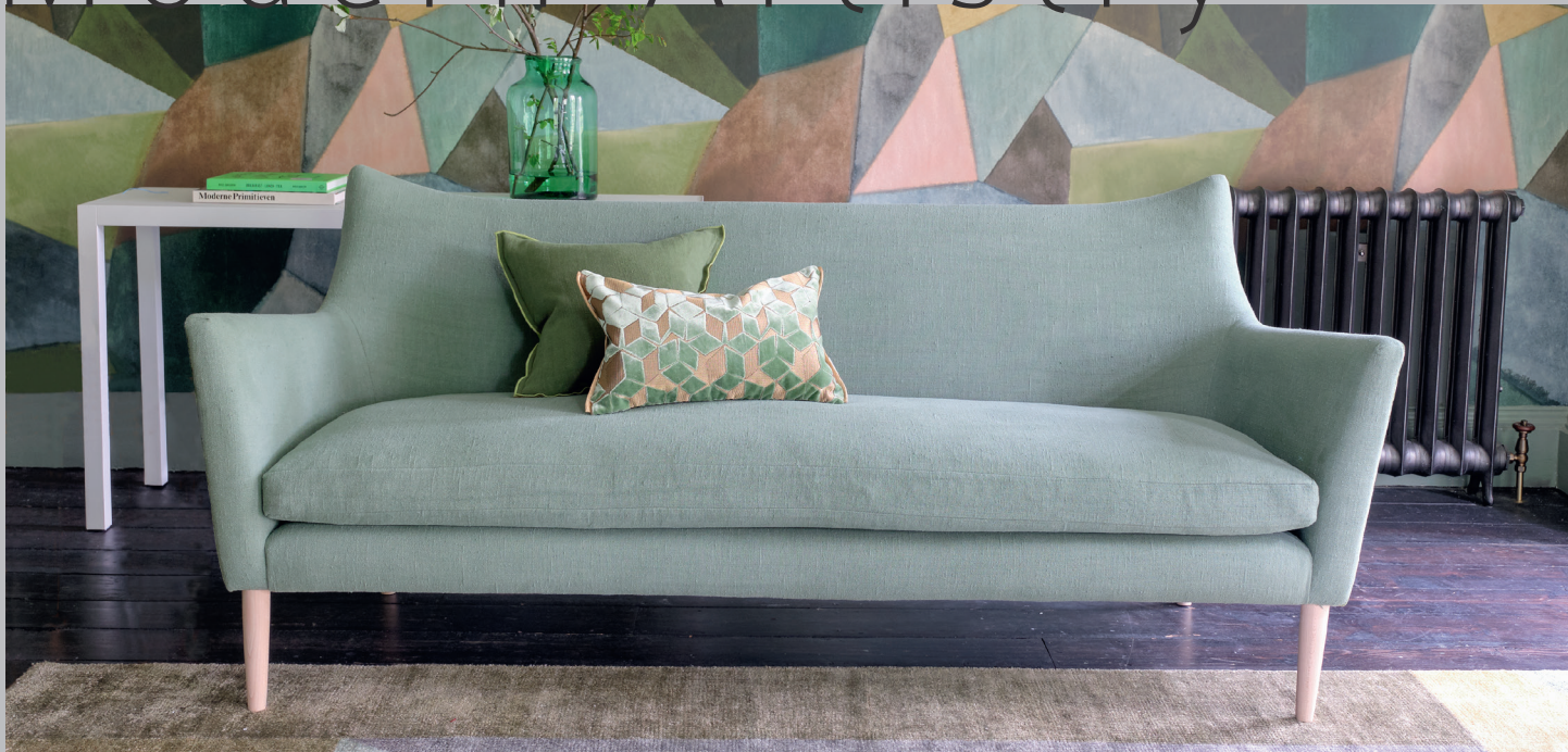
New Prague Sofa in Brera Moda Thyme linen