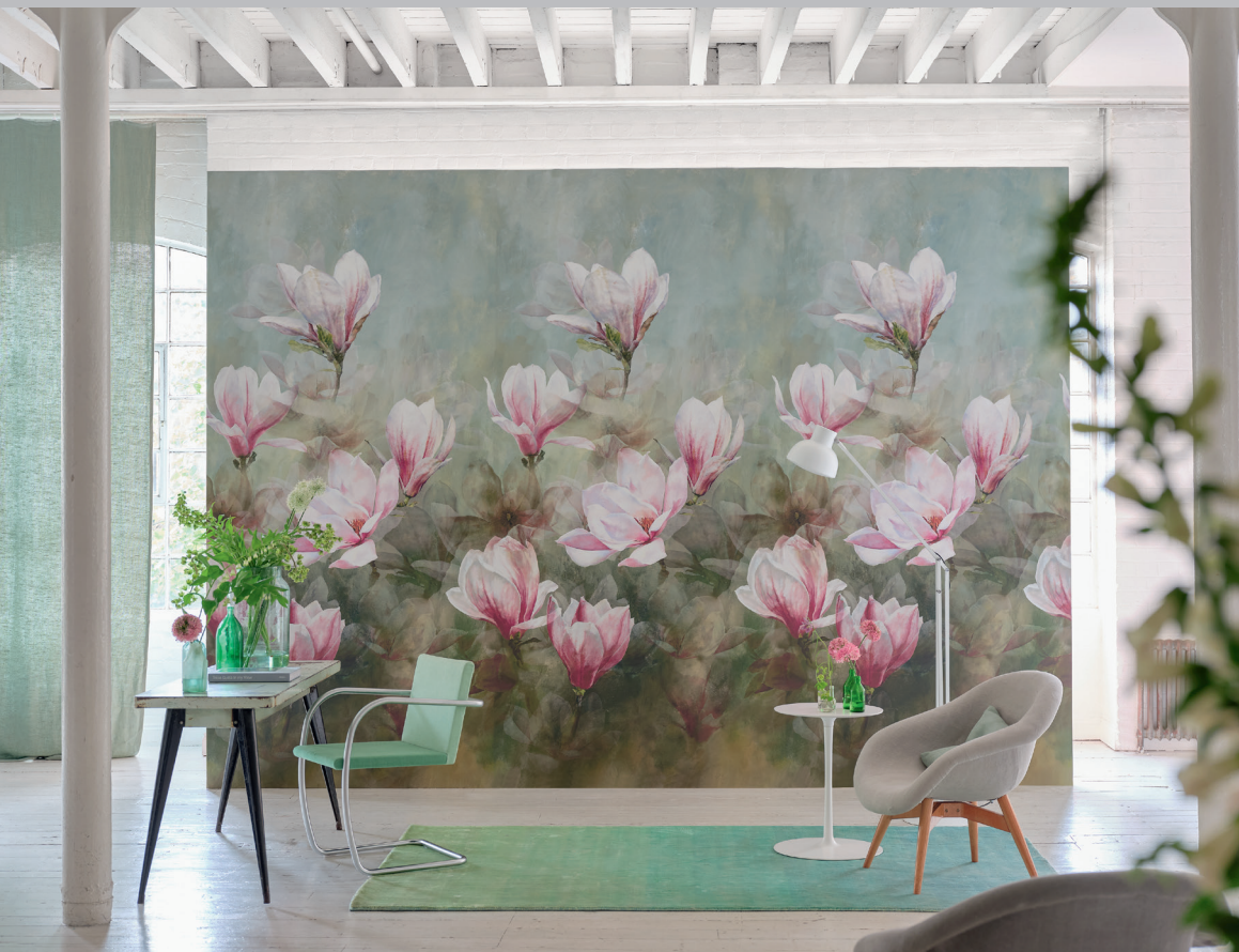
Yulan Wallpaper Panel

From sublime serene flowers and textures to atmospheric artistic panoramas. Our new collection of scenes and murals offer a variety of extraordinary statements for your walls.