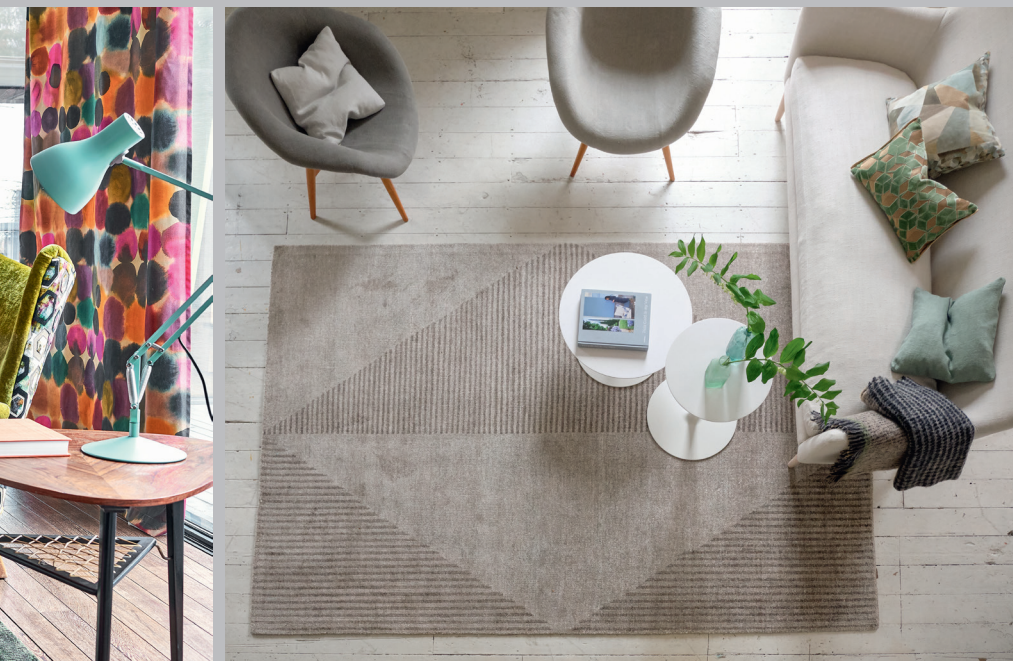
Kappazuri Zinc Rug

is delicately towards a shaded and dappled ground