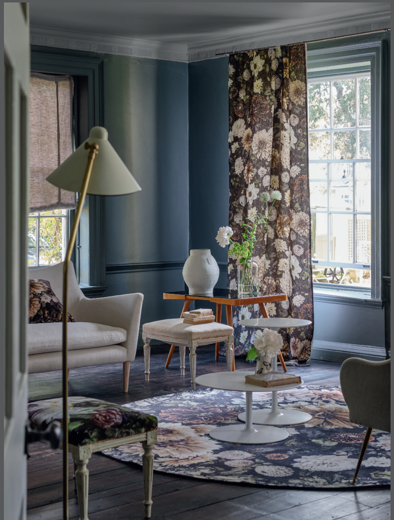
Softly tumbled, pure linen floral fabric