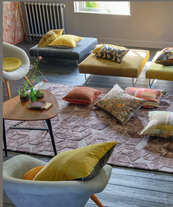
Uchiwa Embroidered Fabric