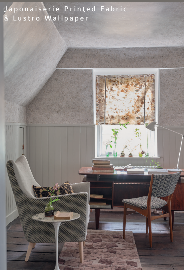
Japonaiserie Printed Fabric & Lustro Wallpaper