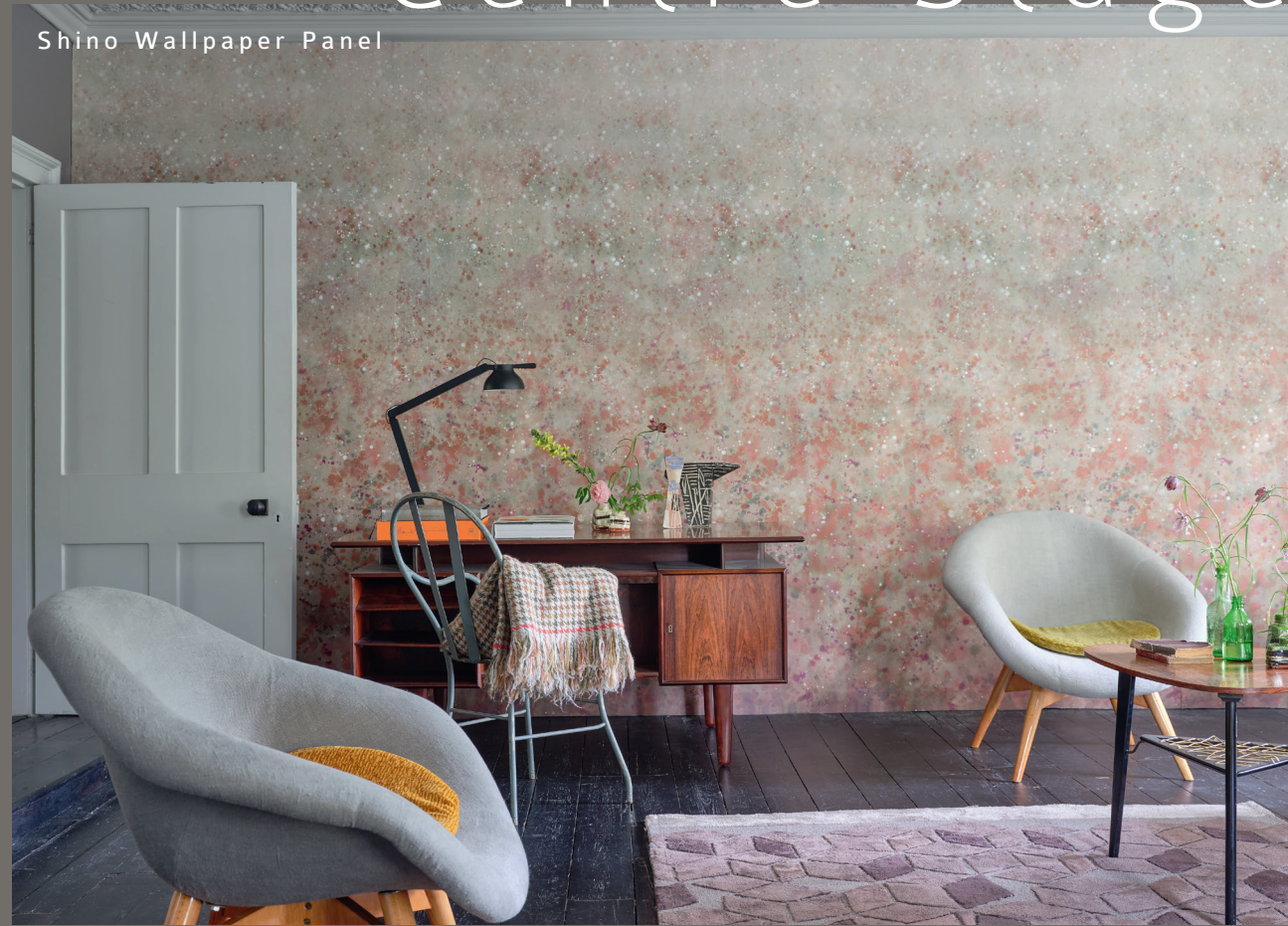
Shino Wallpaper Panel