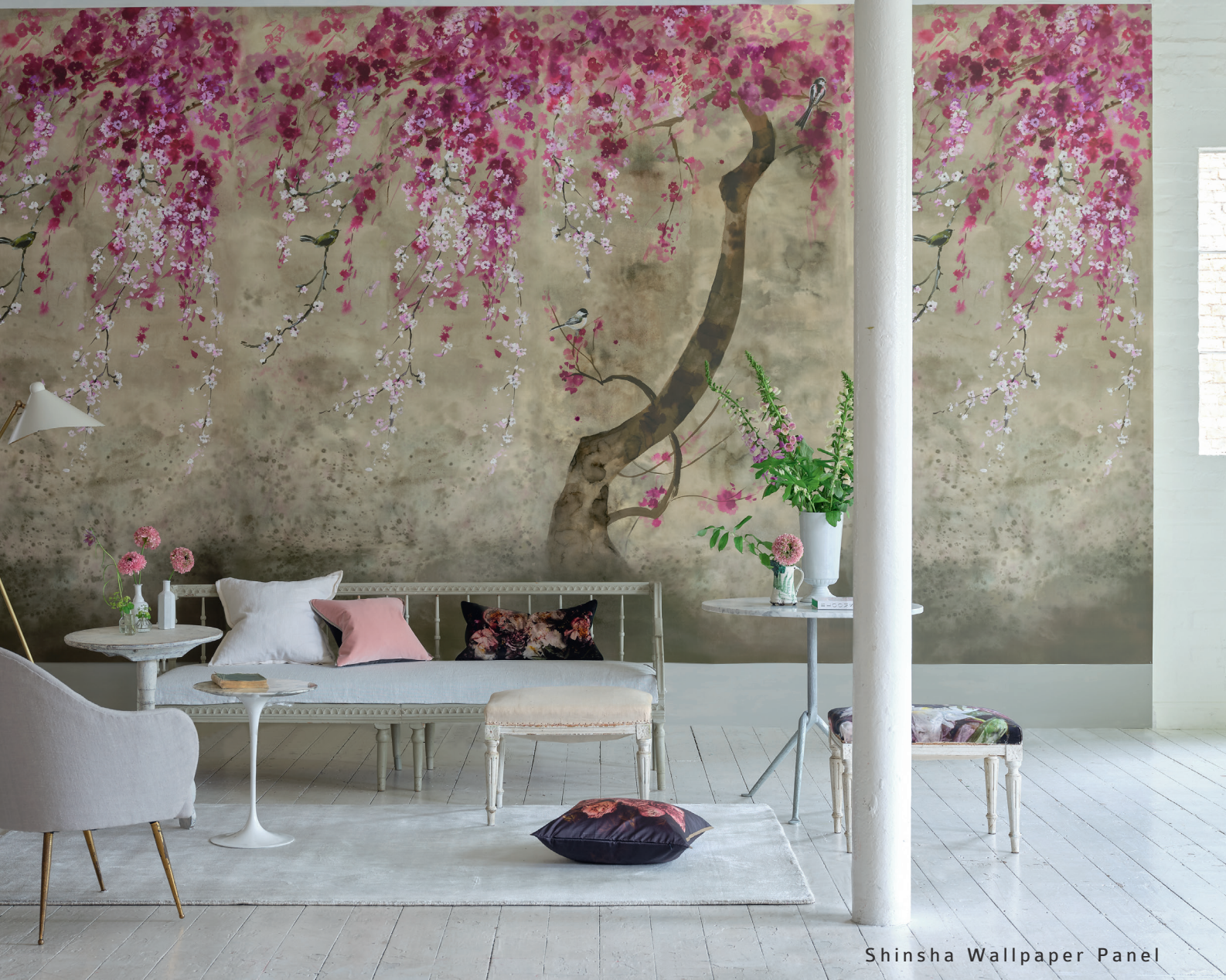
Shinsha Wallpaper Panel

is delicately towards a shaded and dappled ground