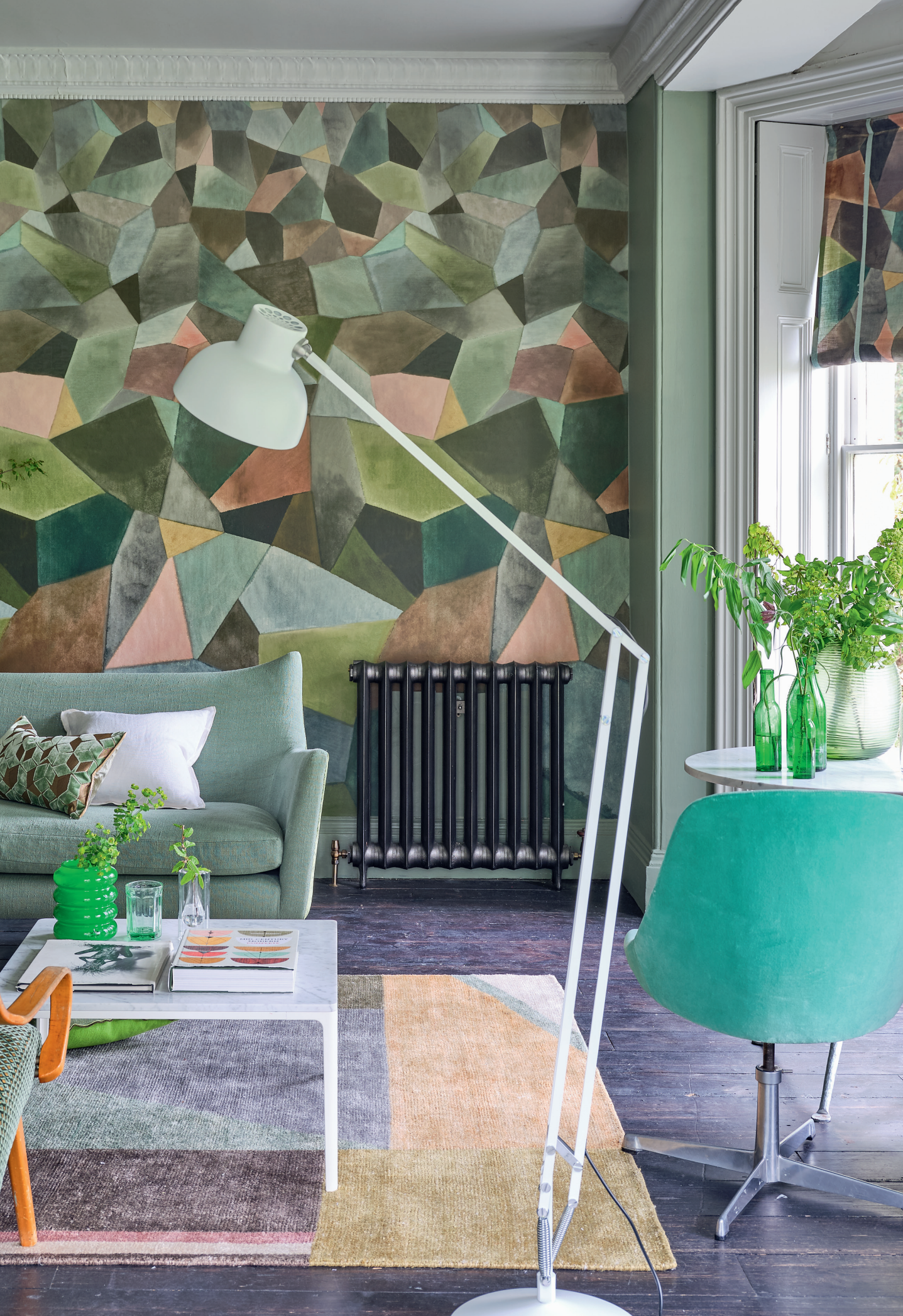
Géo Moderne Wallpaper Panel