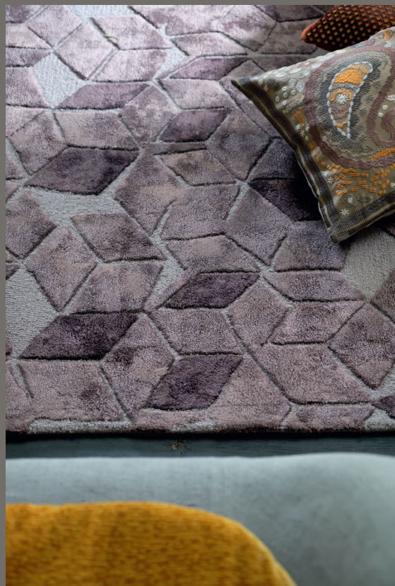
Fitzrovia Espresso Rug