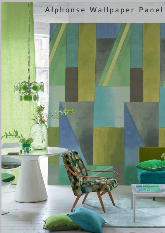
Alphonse Wallpaper Panel