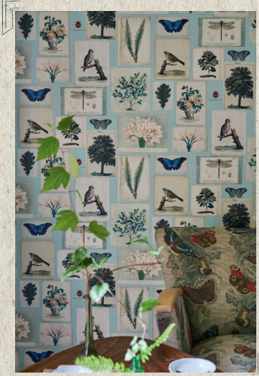
Butterfly Thistle Linen with Flora and Fauna Cloud Blue Wallpaper