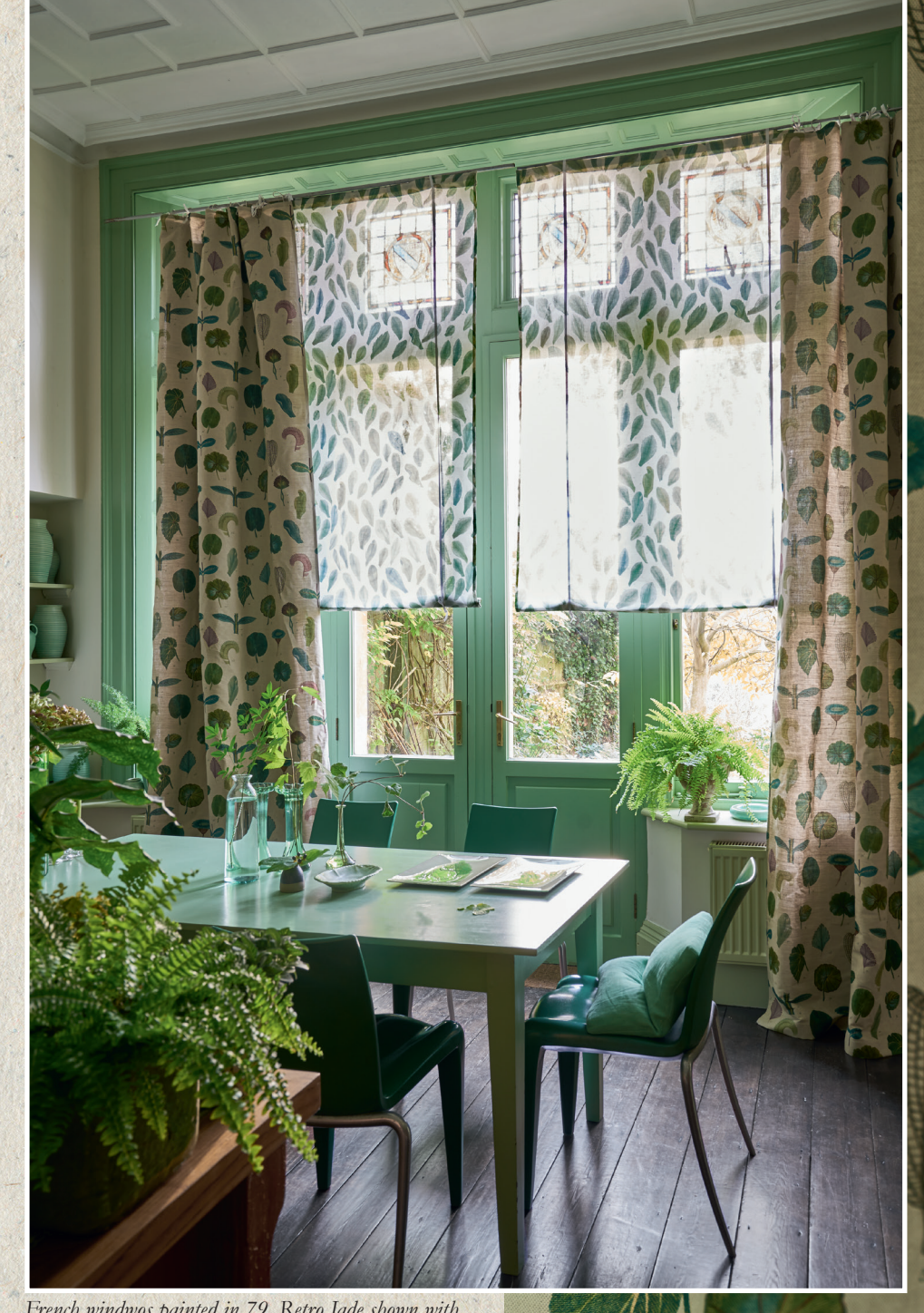
French windwos painted in 79. Retro Jade shown with A Leaf Study Linen and Leaf Specimens Thyme fabrics