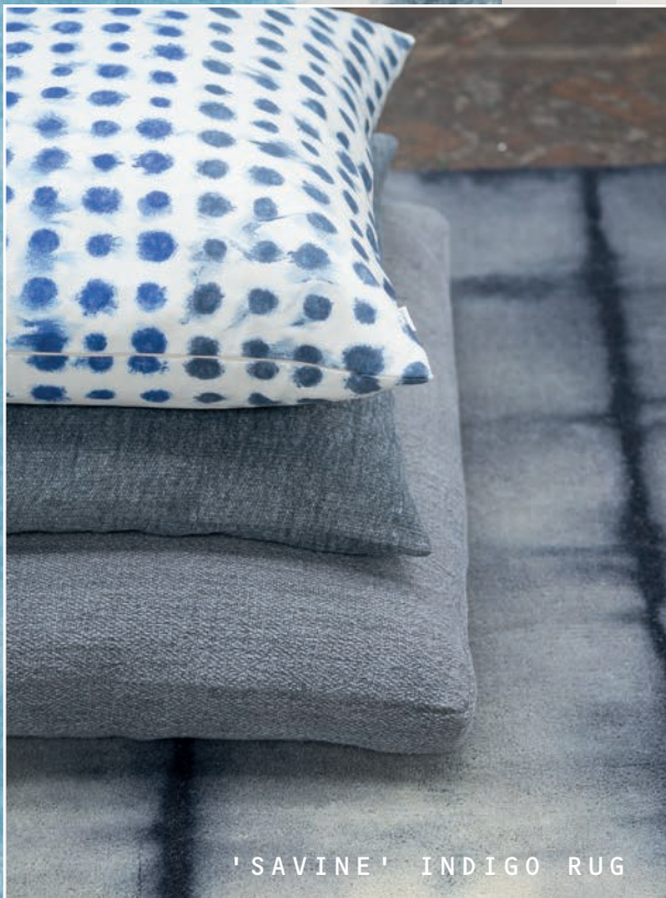
'SAVINE' INDIGO RUG