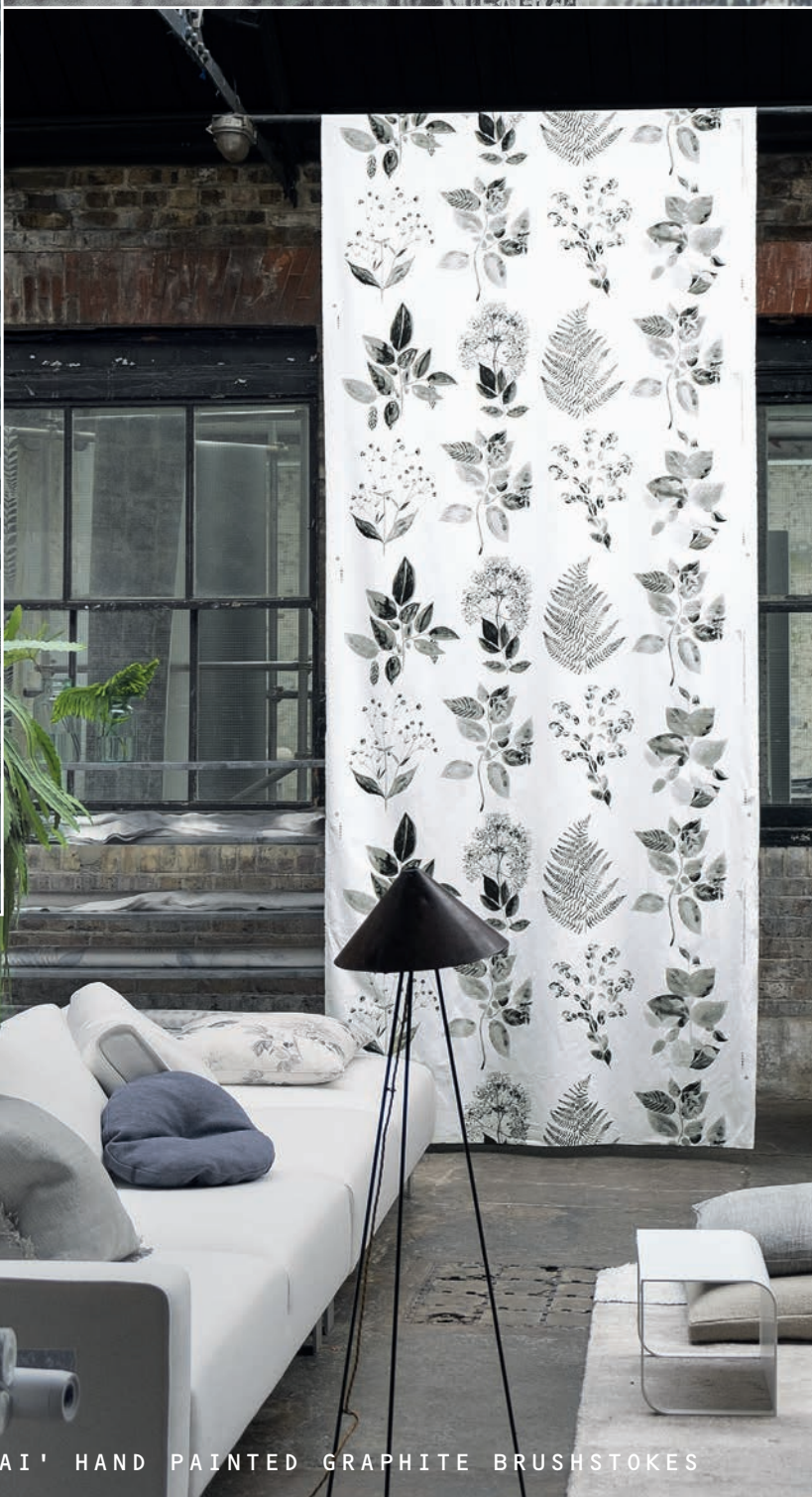
'JINDAI' HAND PAINTED GRAPHITE BRUSHSTOKES