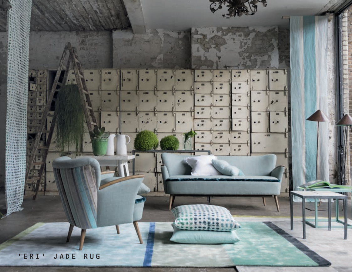
'ERI' JADE RUG