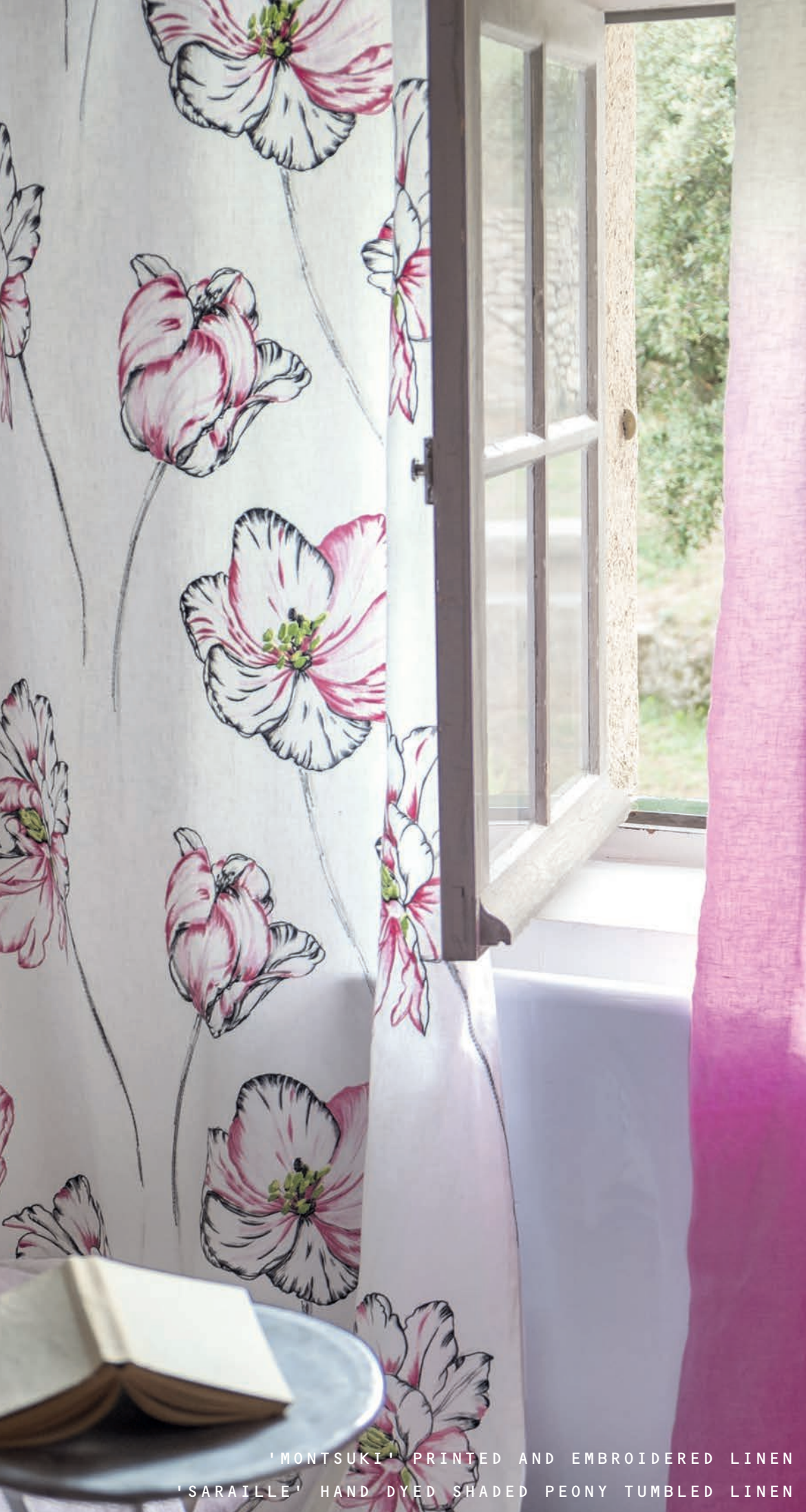
'MONTSUKI' PRINTED AND EMBROIDERED LINEN 'SARAILLE' HAND DYED SHADED PEONY TUMBLED LINEN