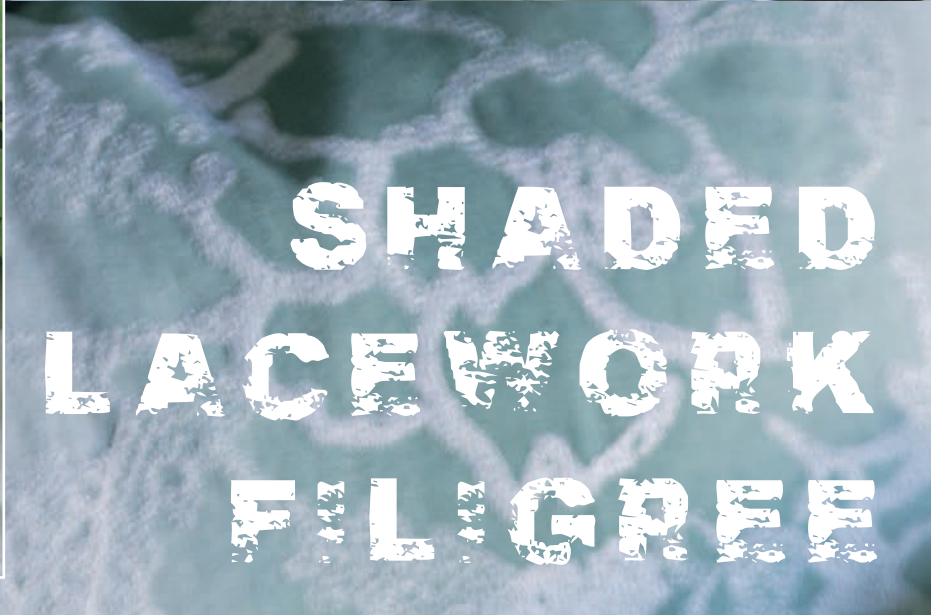
SHADED LACEWORK FILIGREE