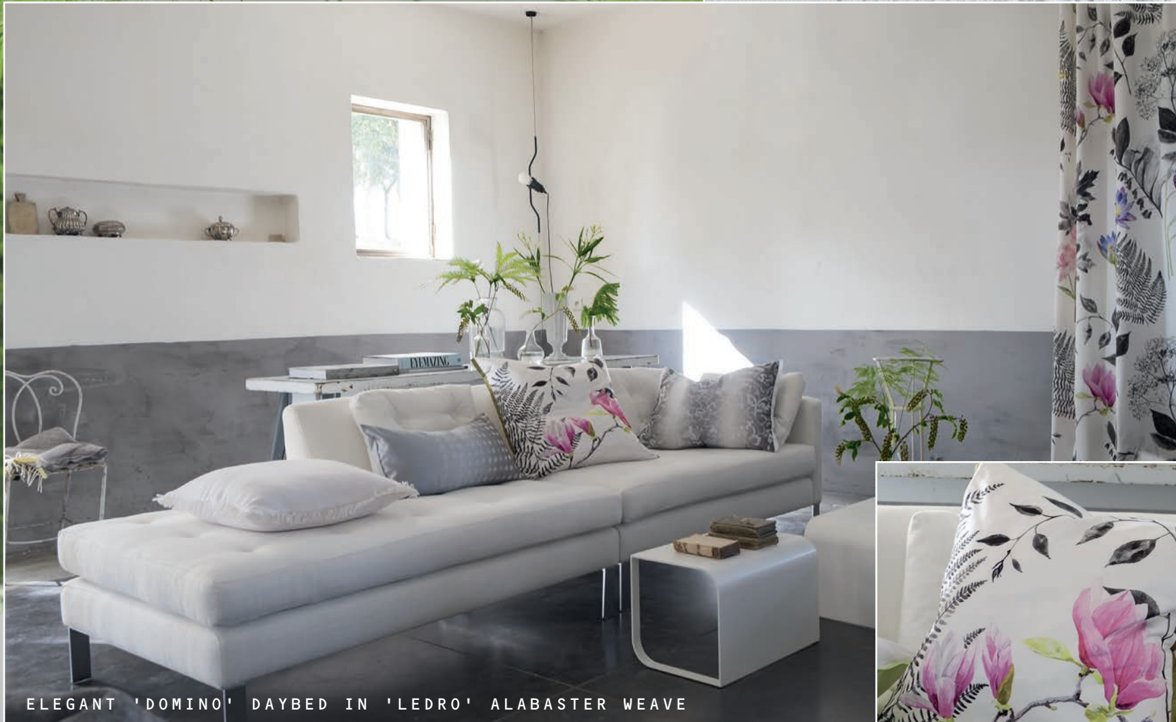
ELEGANT 'DOMINO' DAYBED IN 'LEDRO' ALABASTER WEAVE