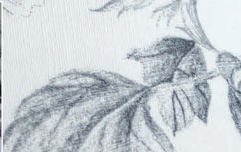
'JINDAI' GRAPHITE RUG