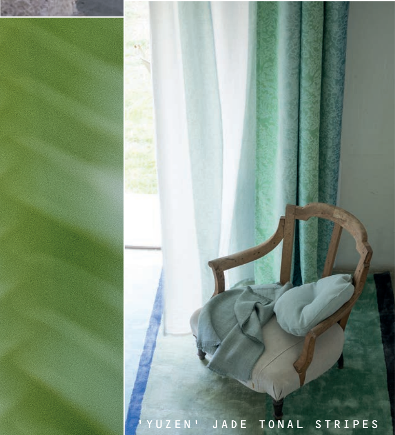
'YUZEN' JADE TONAL STRIPES