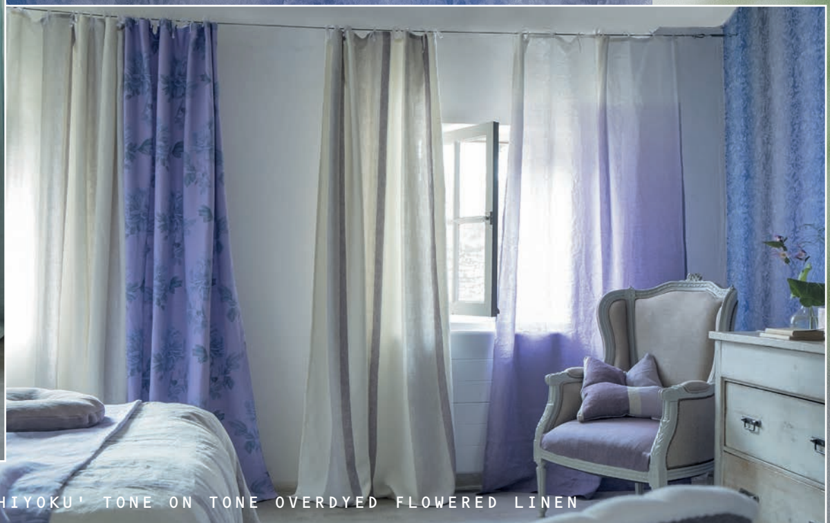
'HIYOKU' TONE ON TONE OVERDYED FLOWERED LINEN