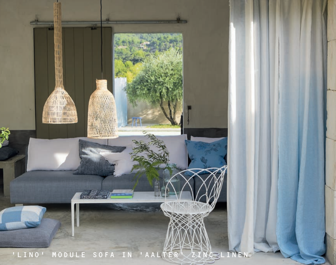
'LINO' MODULE SOFA IN 'AALTER' ZINC LINEN