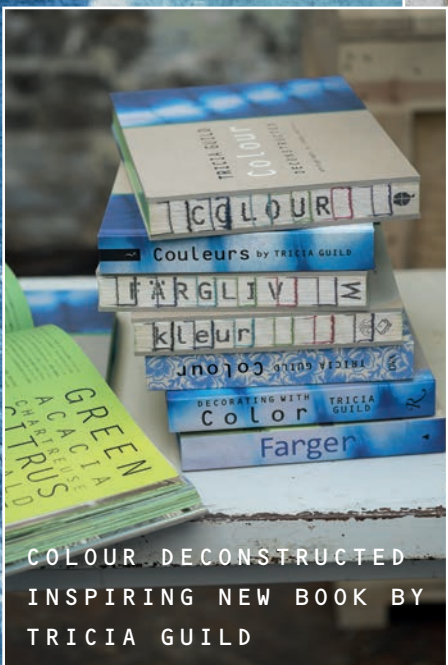
COLOUR DECONSTRUCTED INSPIRING NEW BOOK BY TRICIA GUILD