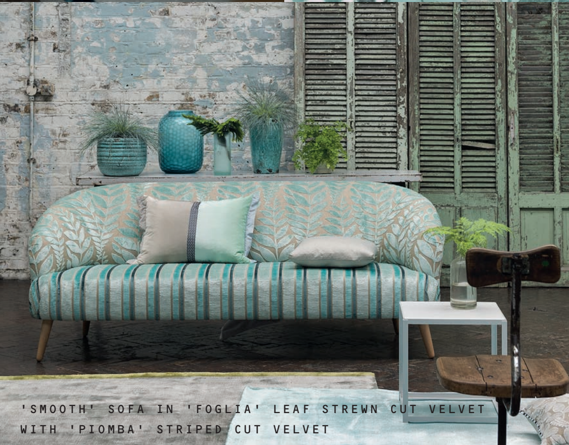
'SMOOTH' SOFA IN 'FOGLIA' LEAF STREWN CUT VELVET WITH 'PIOMBA' STRIPED CUT VELVET