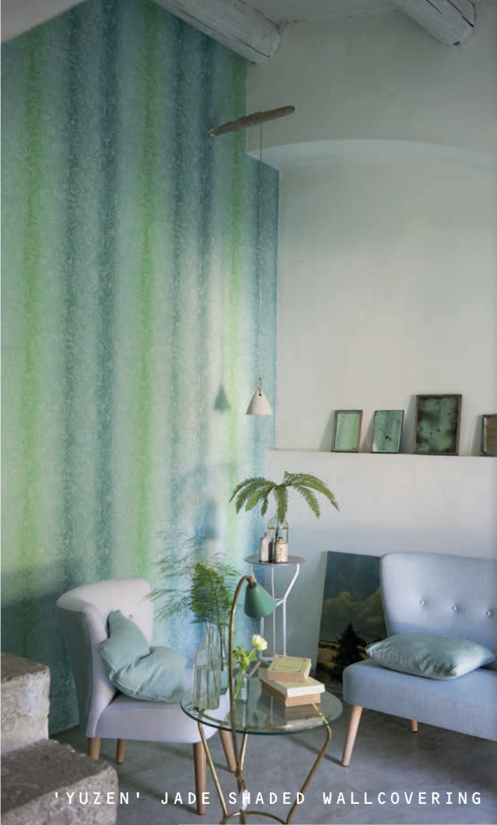
'YUZEN' JADE SHADED WALLCOVERING