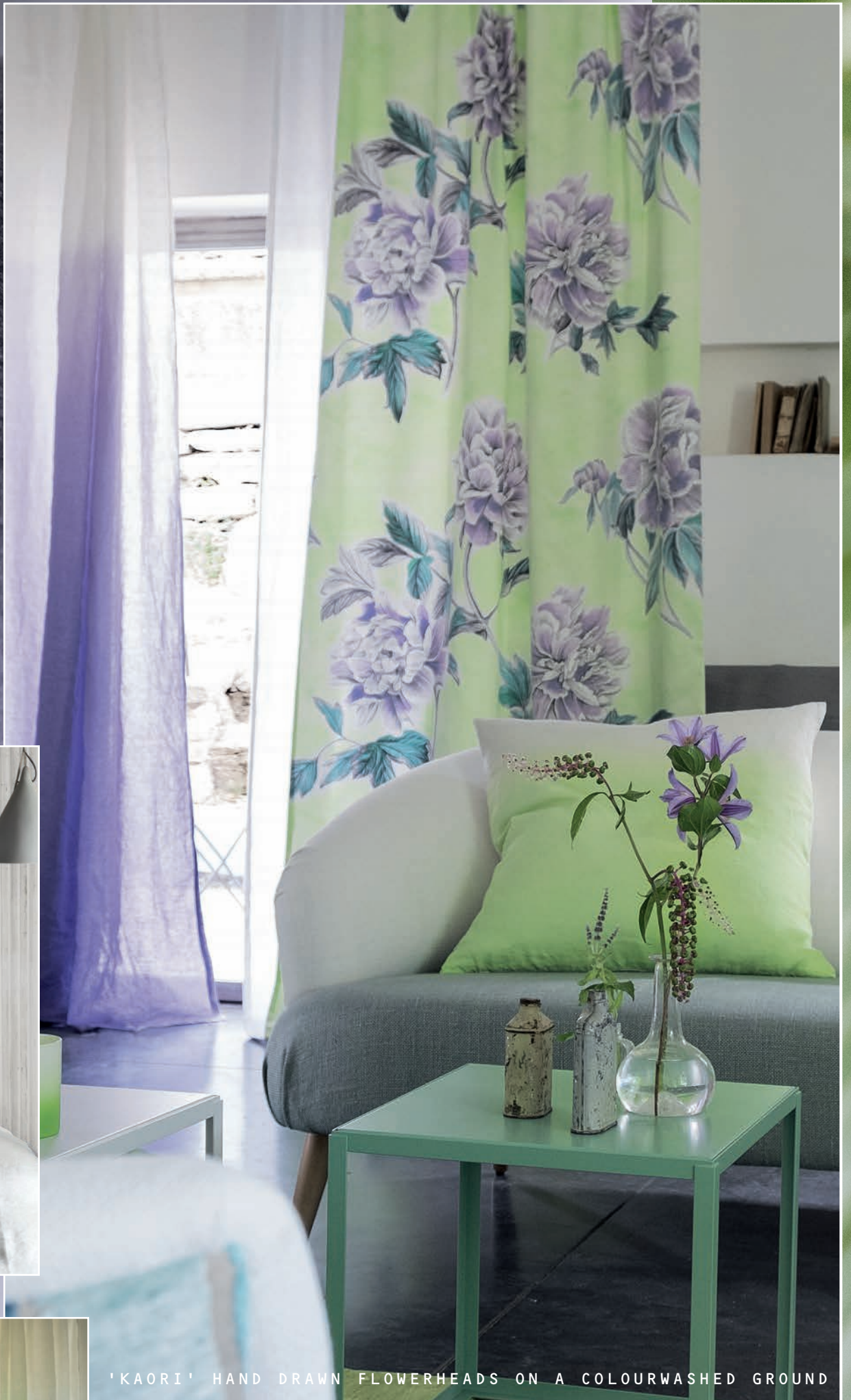
'KAORI' HAND DRAWN FLOWERHEADS ON A COLOURWASHED GROUND