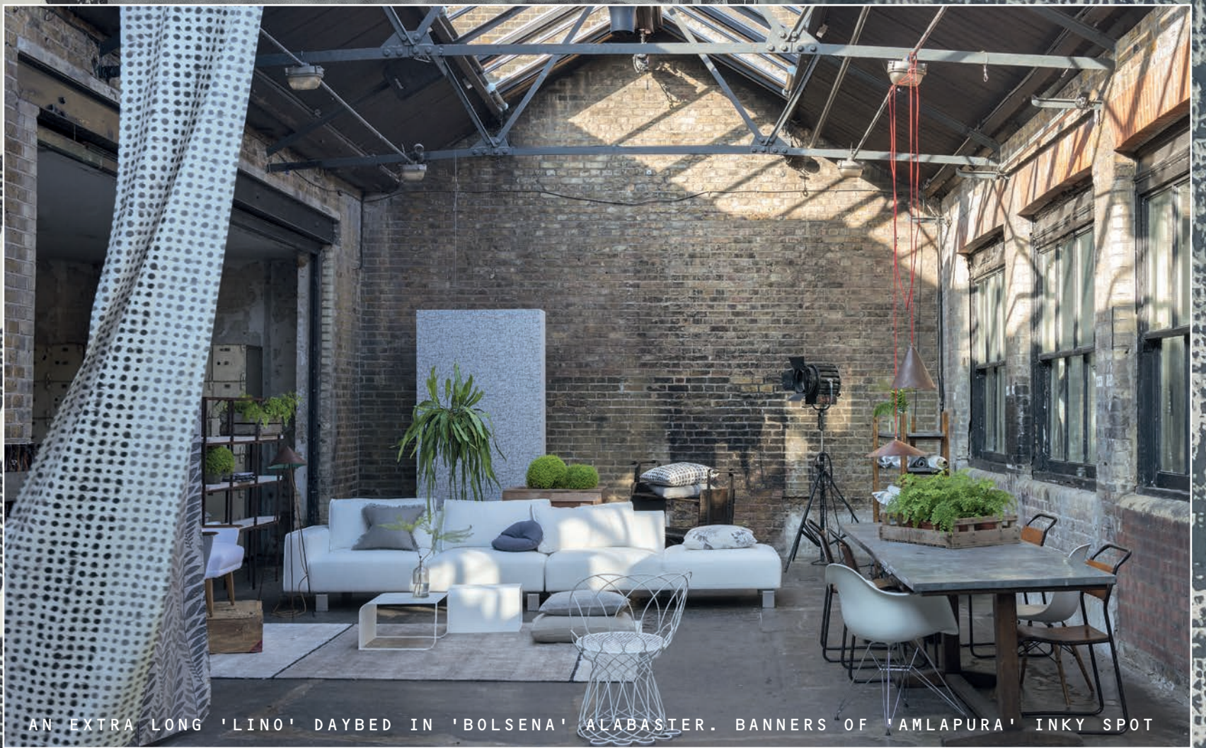
AN EXTRA LONG 'LINO' DAYBED IN 'BOLSENA' ALABASTER. BANNERS OF 'AMLAPURA' INKY SPOT