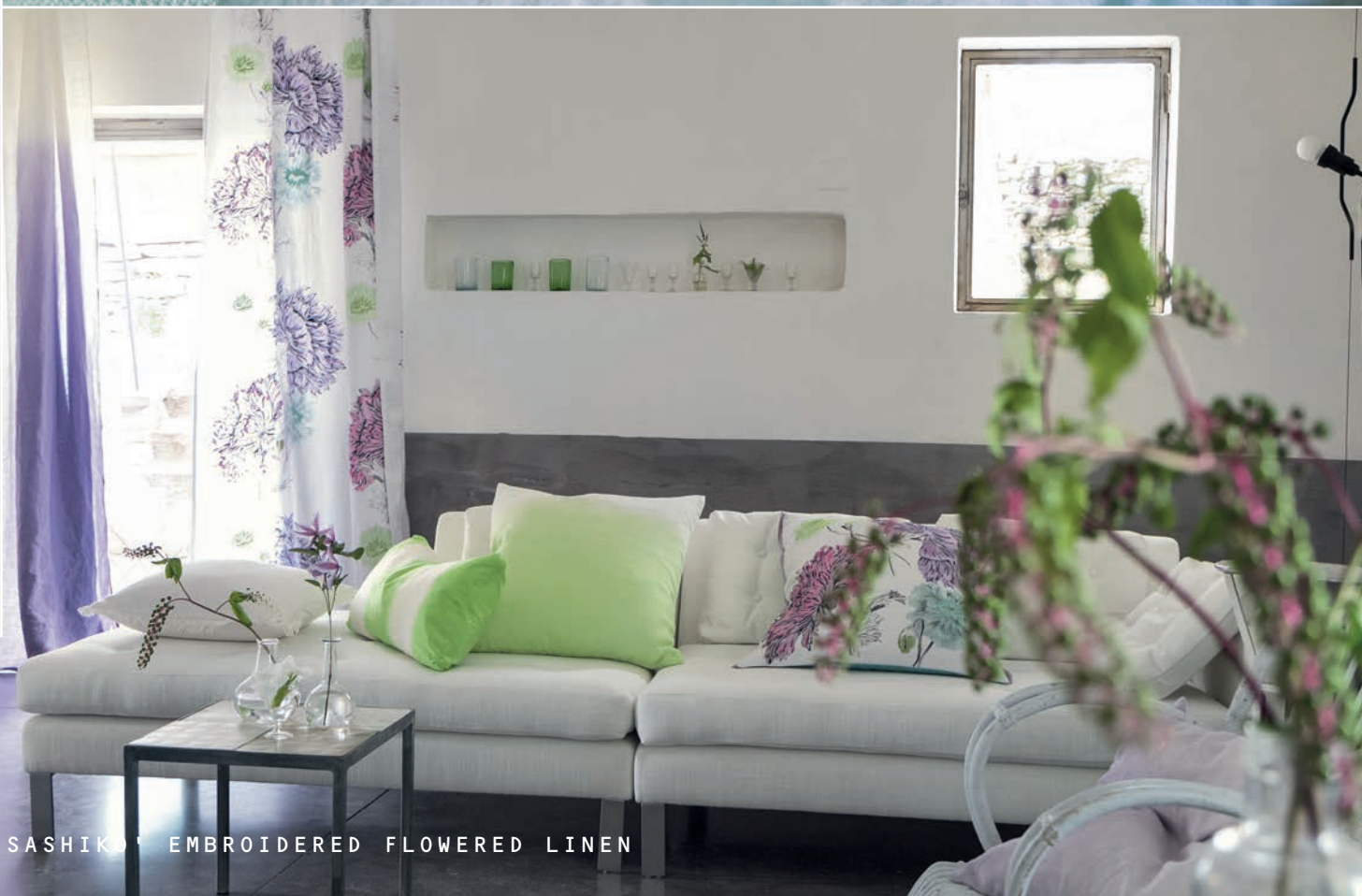
'SASHIKO' EMBROIDERED FLOWERED LINEN