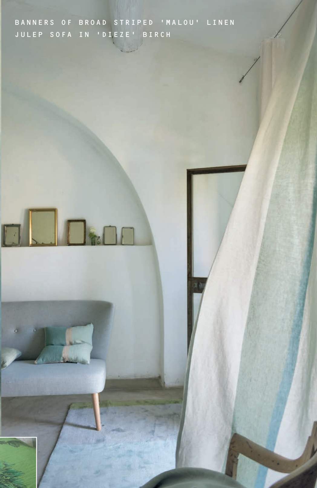
BANNERS OF BROAD STRIPED 'MALOU' LINEN JULEP SOFA IN 'DIEZE' BIRCH