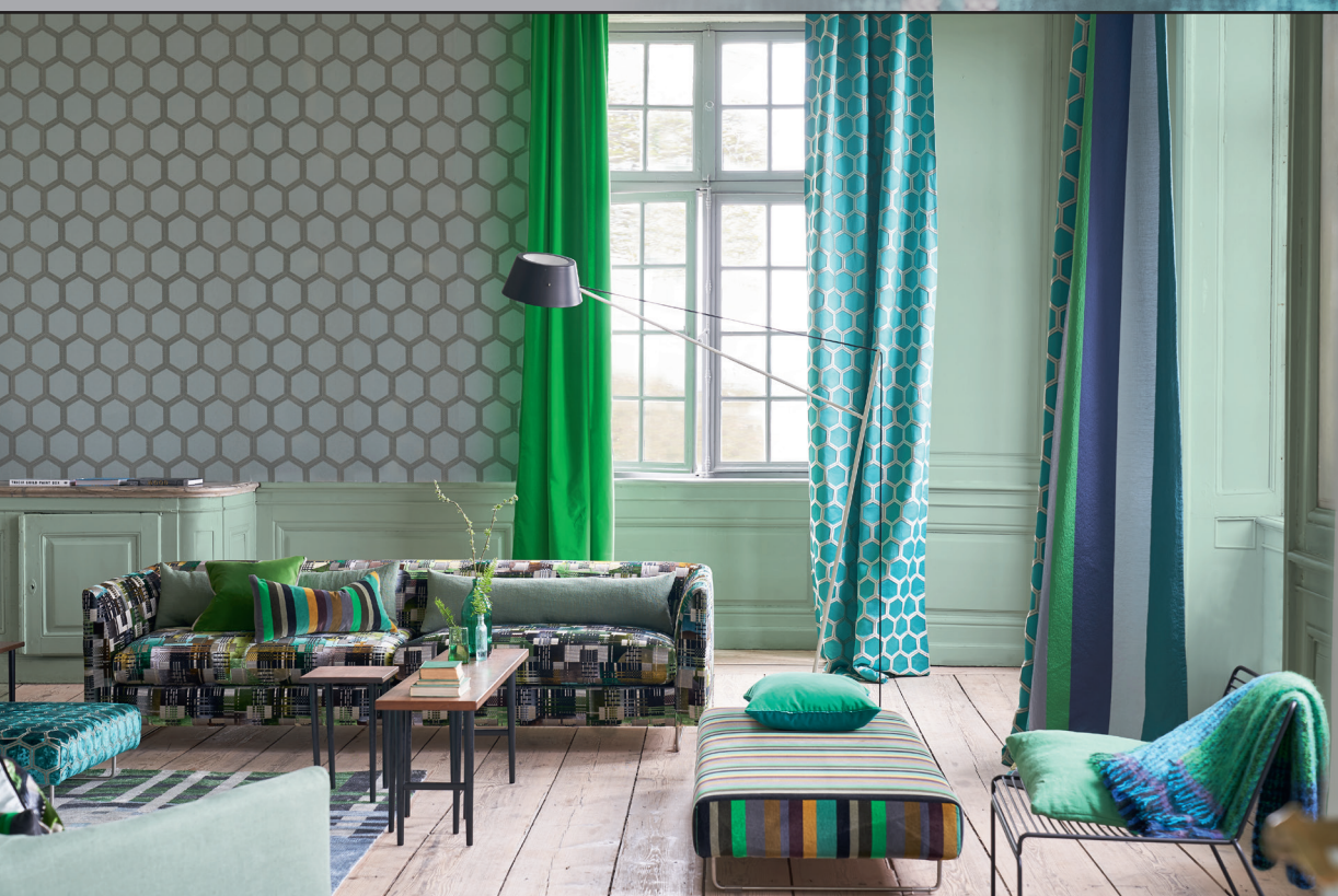
PANELLING PAINTED WITH NO. 86 SALVIA AND CURTAINS FROM ZARDOZI TAFFETAS