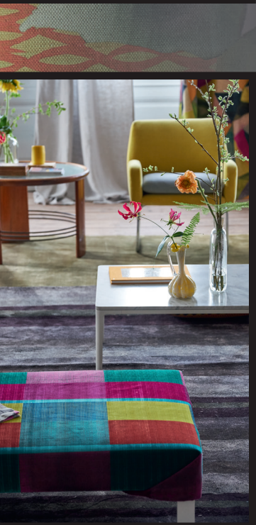
WALLS PAINTED WITH NO. 151 AUTUMN MOOR