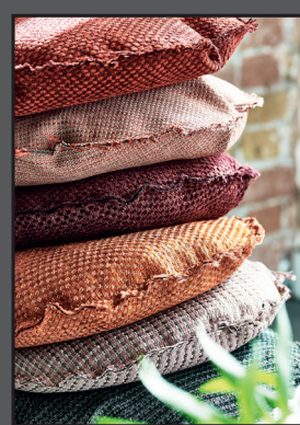
KESWICK MINERAL WEAVES BRERA LINO PAVIA ROTHESAY CONWAY ZARAGOZA