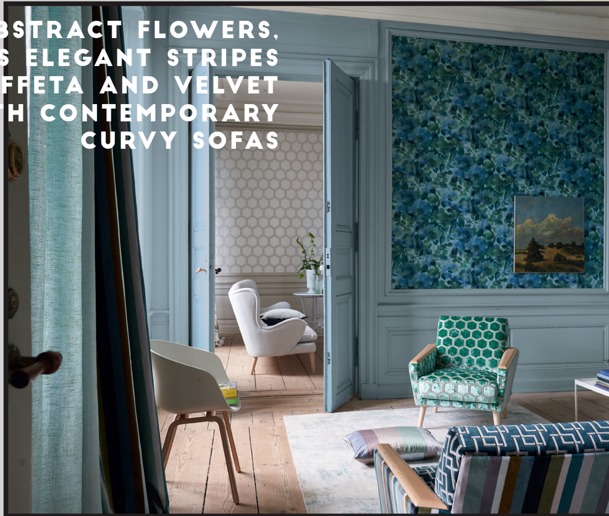
SURIMONO WALLPAPER AND WOODWORK IN NO. 68 SLATE BLUE

INKY ABSTRACT FLOWERS, LUXURIOUS ELEGANT STRIPES OF TAFFETA AND VELVET WITH CONTEMPORARY CURVY SOFAS