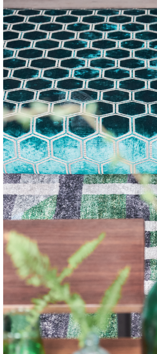
BALANCE SQUARE STOOL IN MANIPUR