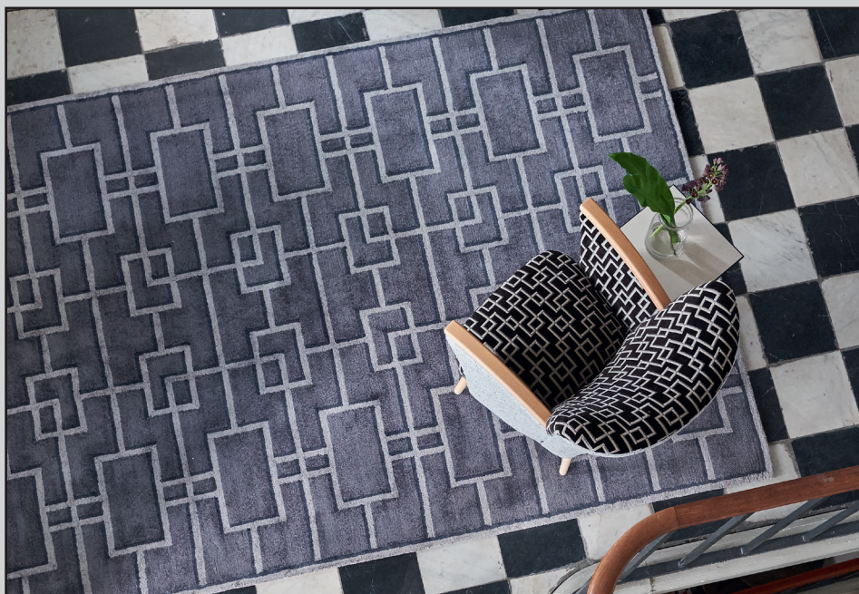
GRAPHIC RHEINSBERG GRANITE RUG