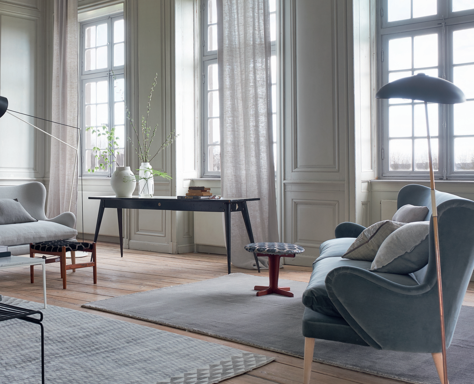
NEW PALERMO SOFAS IN BRERA MODA ALABASTER LINEN AND VARESE GRAPHITE VELVET