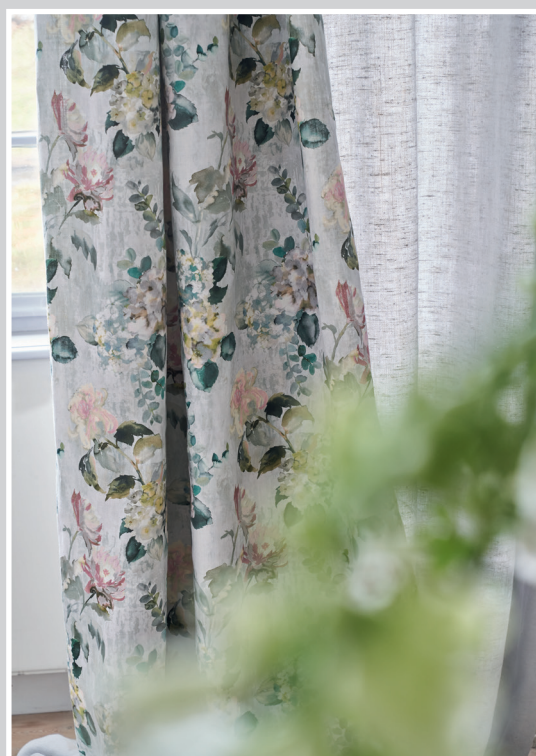
ADACHI PAINTERLY BLOOMS ON LINEN