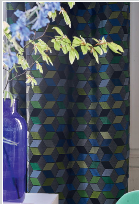
STRIKING BALUCHAR TAFFETA