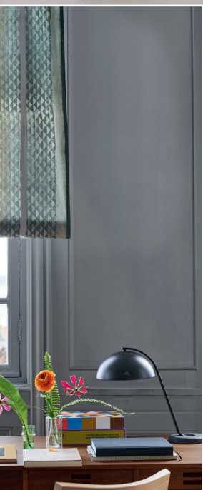
WITH NO. 38 APPLETON GREY