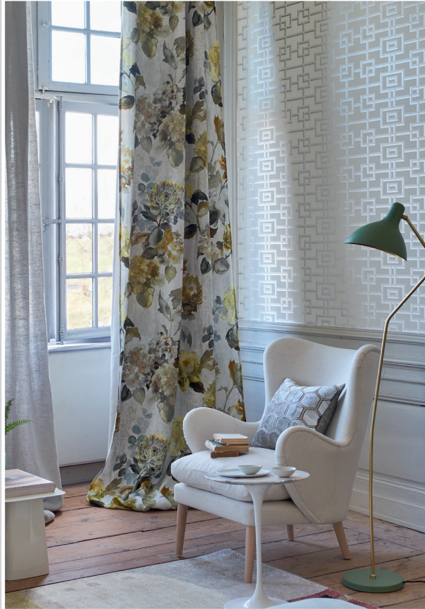
BIRCH HUED FLORAL PRINT KIKU