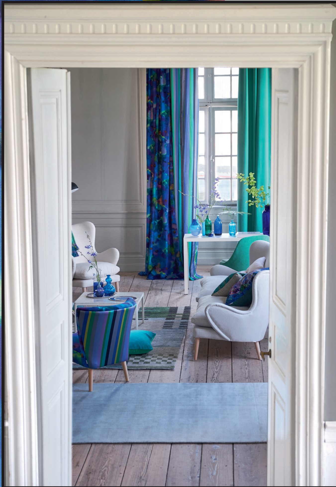
SANSUI PRINTED VELVET AND TANCHOI STRIPED TAFFETA DOORWAY PAINTED IN NO. 2 WHITEWASH