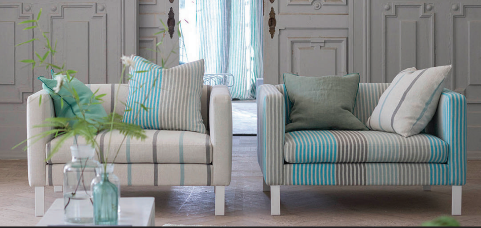
BRERA RIGATO II SENSATIONAL PURE LINEN STRIPES NATURALLY BEAUTIFUL WITH A TAILORED EDGE