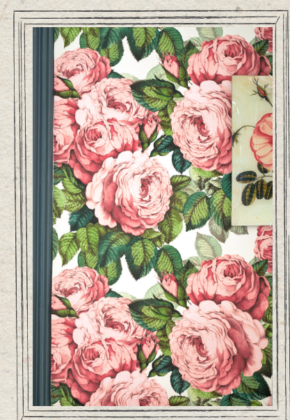
The Rose Tuberose