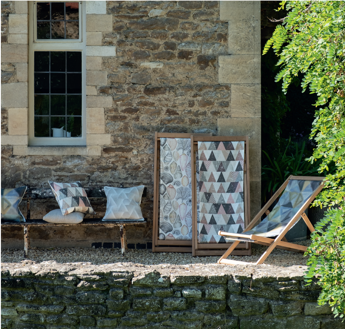
COOL NEUTRALS WITH VIBRANT COLOUR • GEOMETRIC SHAPES • WASHABLE POMPANO NATURAL AND DELRAY NOIR RUGS ALSO AVAILABLE IN RUNNER RUG SIZE