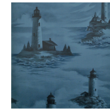
PRL5022/04 PEMAQUID MIDNIGHT