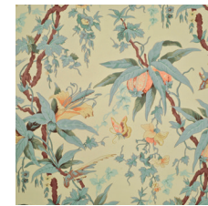
PRL5023/02 MARY DAY BOTANICAL TEA