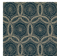
FRL5095/01 MINGEI BATIK INDIGO