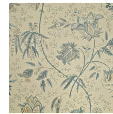
PRL5026/04 PILLAR POINT FLORAL DEW