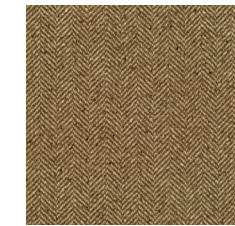
PRL5029/03 STONELEIGH HERRINGBONE COFFEE