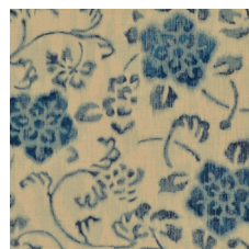
FRL5092/01 KOTORI FLORAL PORCELAIN