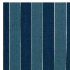
FRL5098/01 NIKKO STRIPE INDIGO