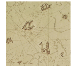
PRL5027/02 SEARSPORT MAP PARCHMENT