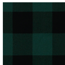
FRL5104/02 CRAFTSMAN PLAID JADE