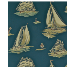
PRL5024/03 DOWN EASTER BOATS ATLANTIC